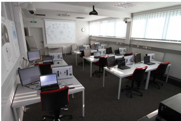
The Schönaich Training Facility

Travel for participants will have to be scheduled in such way that the participating engineer(s) will have sufficient time to complete the full training course. Participants who have to leave before completing the online test at the end of the day will not receive their proof of certification.